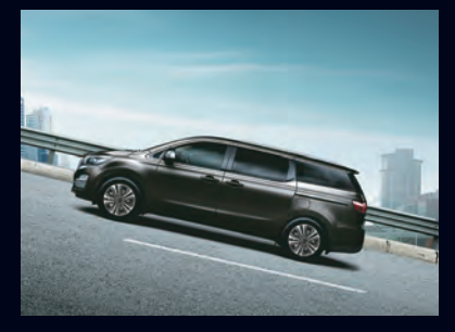
Hill Start Assist Control Hill Start Assist Control prevents the vehicle from rolling back during uphill climb from a static position.

Electronic Stabilty Control It controls brake pressure in challenging driving situations like sudden turns, acceleration, and braking.