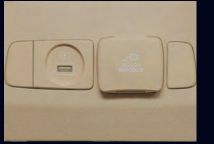
Laptop Charger (220V) and USB Charger Charge your mobile phone, power bank or any such device. You can even power your laptop or mini-refrigerator.

Wireless Smartphone Charger Charge a compatible mobile phone wirelessly on the pad at the front of the centre console.