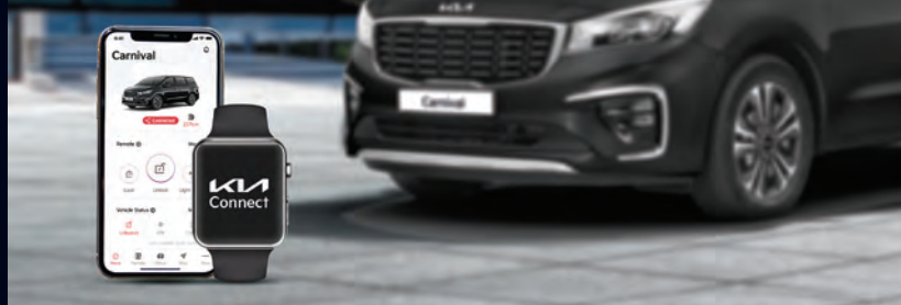
Most inspiring connected car experience with New-gen Kia Connect Kia Connect, with 49 smart features and complimentary subscription is the latest

Kia Connect, with 49 smart features and complimentary subscription is the latest evolution in connected car and infotainment. Just connect your smartwatch and smartphone to the vehicle.