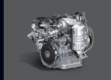
2.2 I Diesel Engine with 200 ps and 440 Nm Torque

BS-6 compliant 2.2 I Diesel Engine is packed with power and performance.