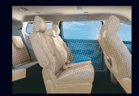
Tri Zone Automatic Temperature Control Every row is assured of absolute comfort, thanks to independent controls for temperature and airflow.

Smart Pure Air Purifier with Virus Protection** The on-board air purifying system keeps the cabin air unaffected by the pollution outside.