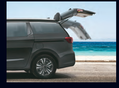
Smart Power Tailgate

The rear Tail Lamps are complete stunners that make the Carnival look even more premium from the back.