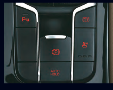
Electronic Parking Brake Parking brake of the Carnival is so convenient that it can be engaged and released with the touch of a button.

Experience sheer extravagance. Every detail of the Carnival is meant to be a treat to your senses, replete with extraordinary features that are designed to indulge.