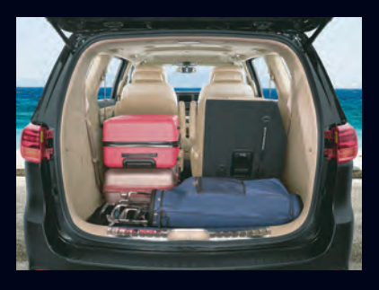
**Boot Space + 3<sup>rd</sup>/4<sup>th</sup> Row Pop-up Sinking Seats With the 3<sup>rd</sup> row in play, you get 540 litres. Fold those seats down and it's a massive 1624 litres of boot space. **By internal testing VDA method

The connected HD Touchscreen renders a futuristic look to the cockpit and reduces distraction while driving.