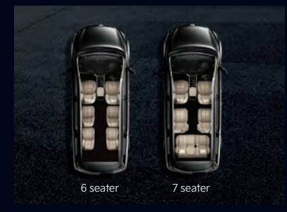
Seat Configuration Comes with 6 and 7 seater options, for families of all sizes.