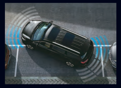
Front and Rear Parking Sensors These sensors help you to safely manoeuvre and park in peculiar Indian conditions.

8-Speed Sportsmatic Transmission (8AT) Enjoy superior driving pleasure and dynamic performance with this transmission, which is one of its kind.