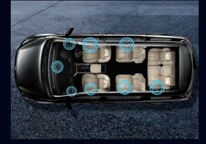
Harman Kardon Premium Sound System Let the premium 8-speaker sound system immerse you in an extravagant surround experience.