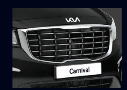
Signature Tiger Nose Grille

LED Headlamps & LED Ice Cube Fog Lamps The aesthetically crafted Headlamp Cluster & Ice Cube shaped Fog Lamps give the vehicle a distinctive character.